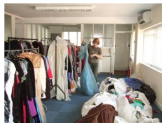
(More photos of the move)